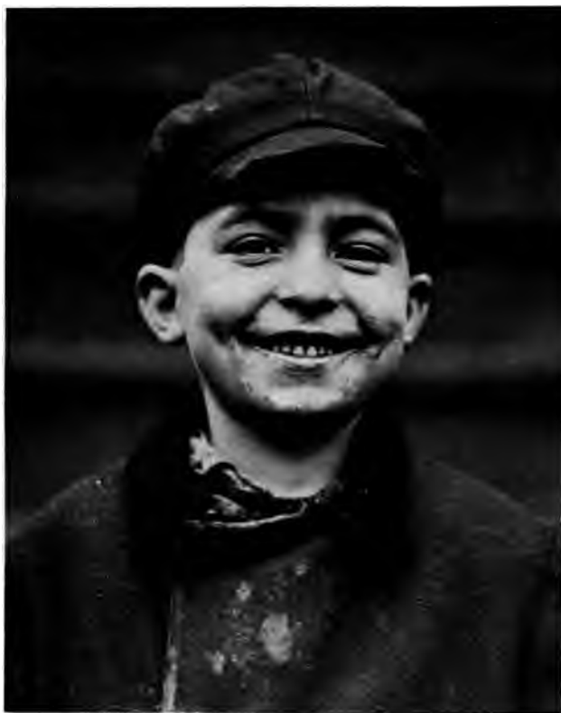
IMPORTED CIVIC TIMBER .